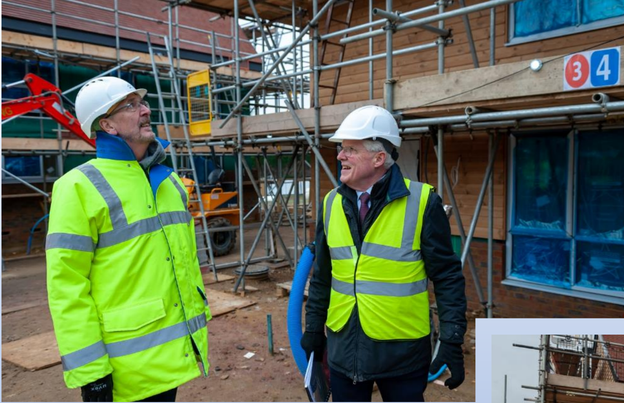
Members of the Parish Council and the RHT Team visit the building site