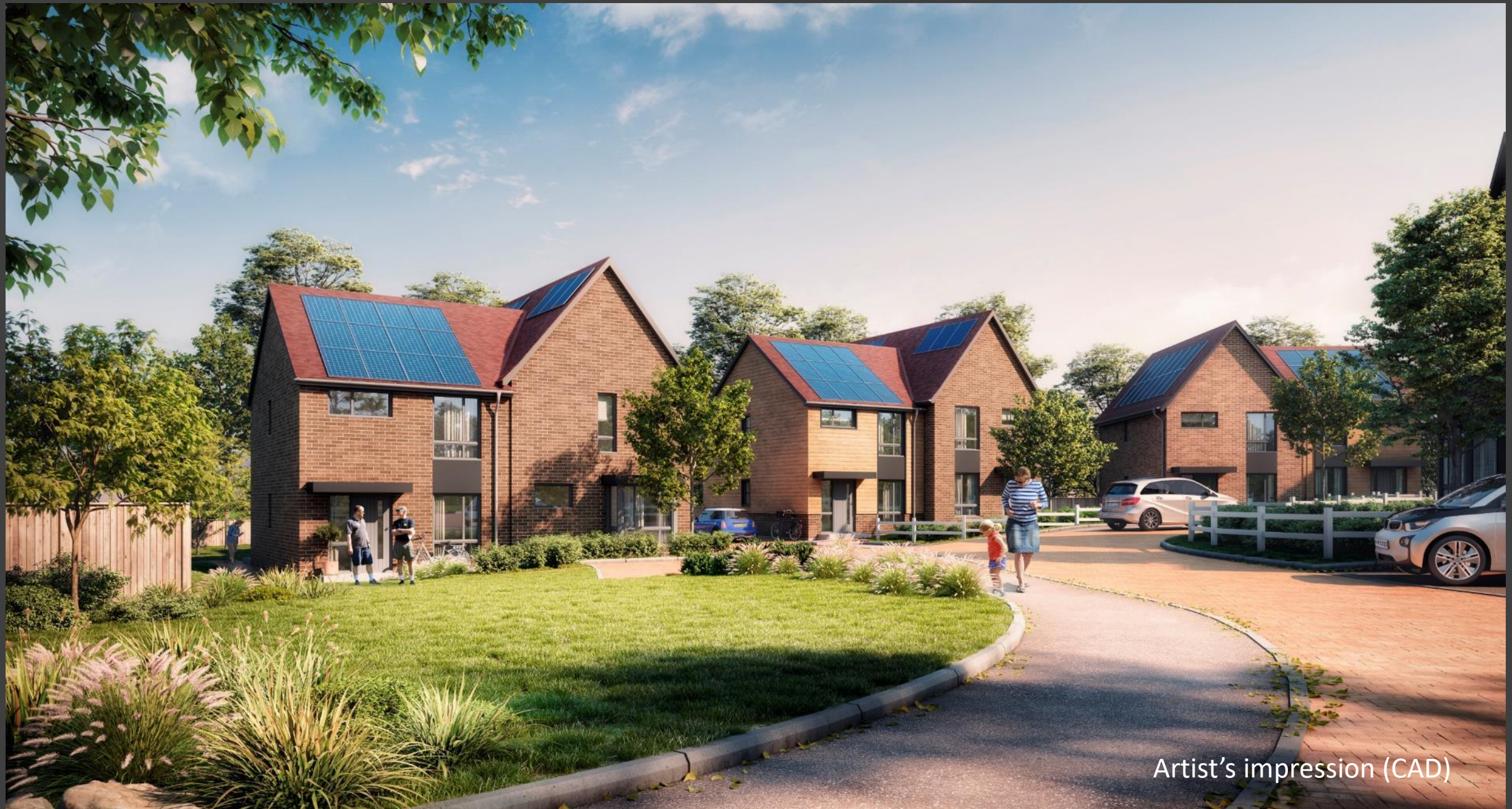
Artist's impression (CAD)