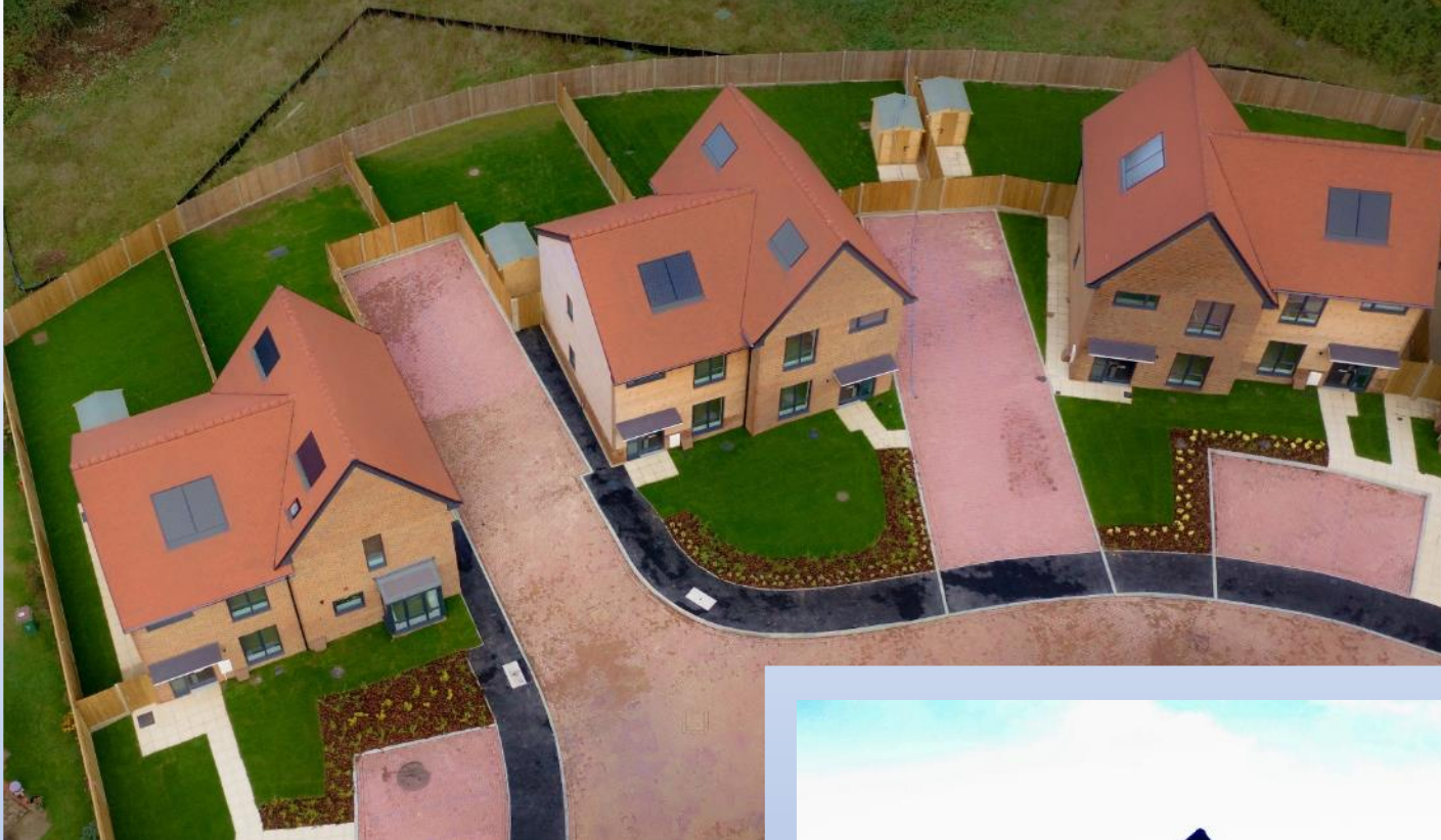
Drone photos of the completed houses