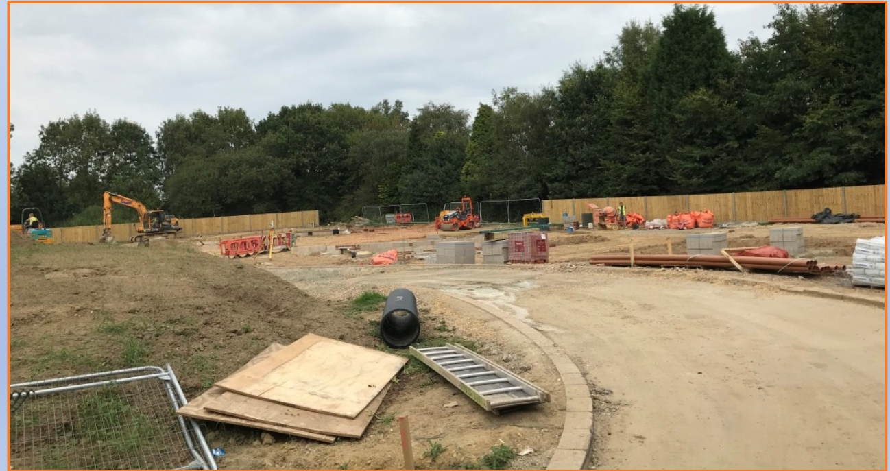
Access to the new development was from one of RHT's existing housing developments and photographs of the new foundations